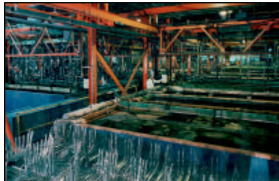
Rack Plating Line