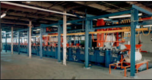
Barrel Plating Line