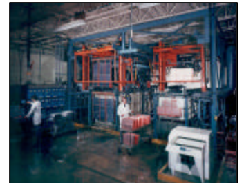
Printed Circuit Board Plating Line